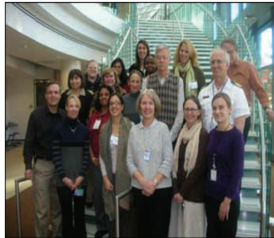
CDC staff who attended the first of our 2-day short courses