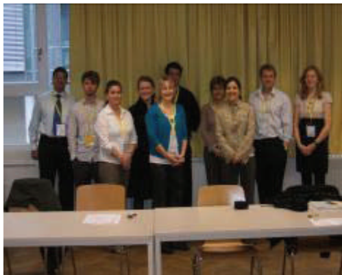
Some attendees at the PHRG meeting