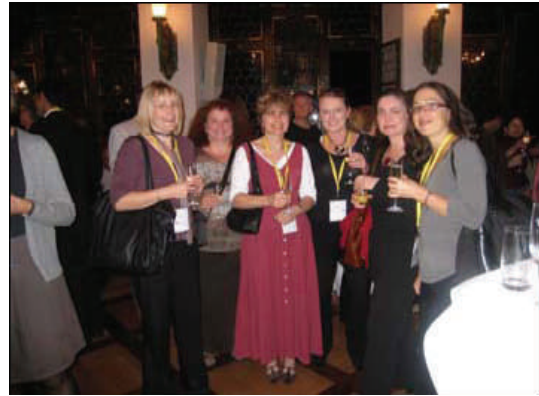
Staff of the PHRG from Cardiff and Melbourne

Every year the Cochrane Collaboration hosts a Colloquium – a chance for editors, authors, consumers, researchers and entity staff to come together to share ideas, build collaborations and develop methods for conducting systematic reviews. This year's meeting was held in Freiburg, a small University town close to the Black Forest in Germany. The Colloquium was the first attended by the Public Health Review Group since our registration in April 2008. A number of our editors, authors and entity staff attended.